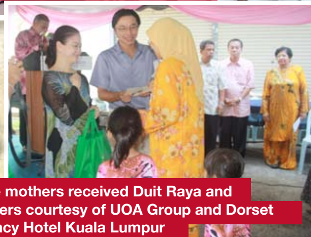
Single mothers received Duit Raya and Hampers courtesy of UOA Group and Dorset Regency Hotel Kuala Lumpur