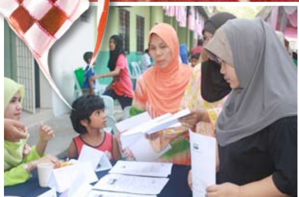
A display of up-coming programs for the women and girls at the event.