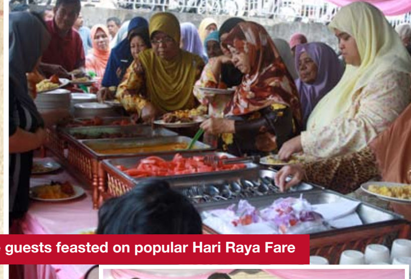
The guests feasted on popular Hari Raya Fare