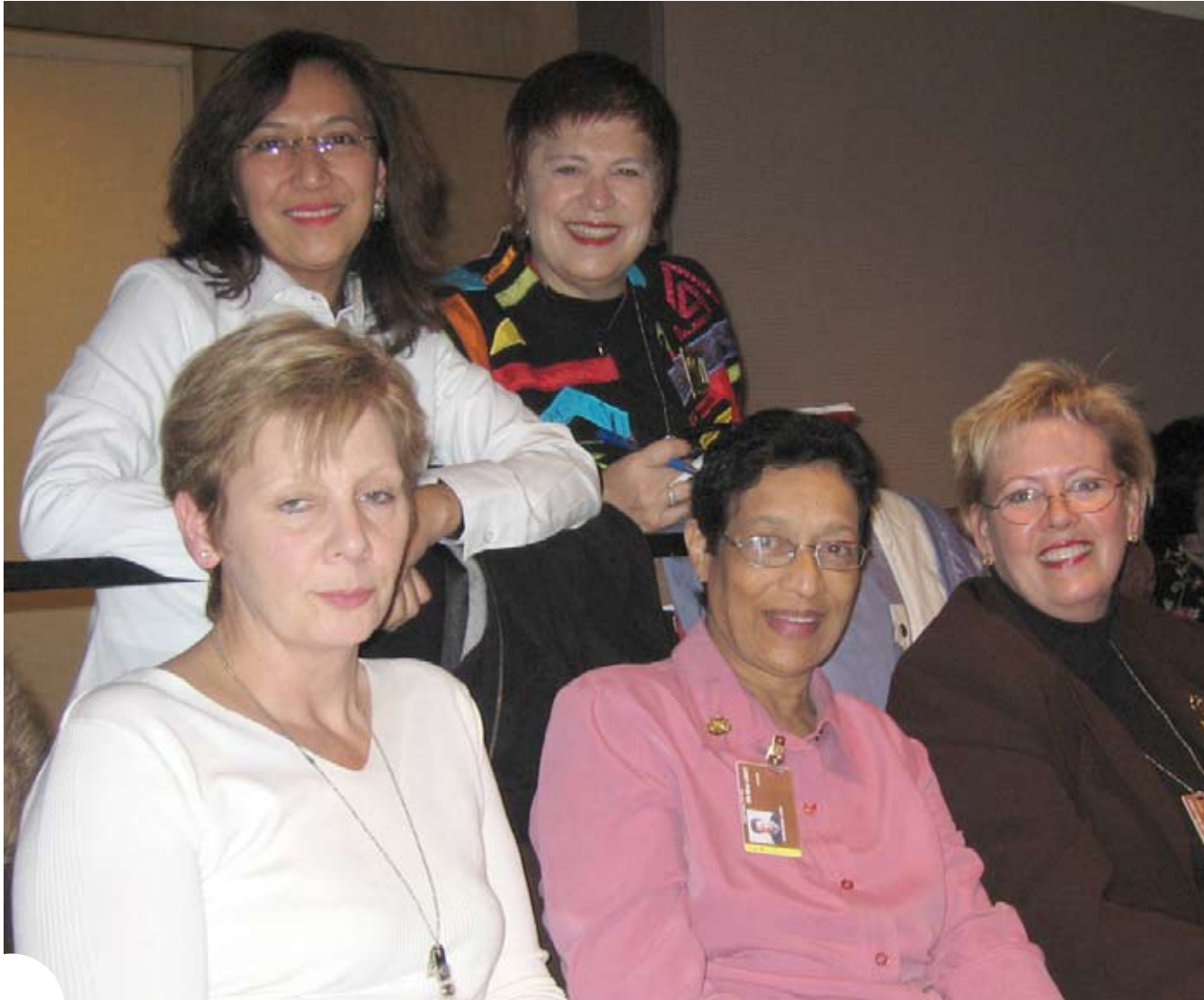
At UN Conference Room